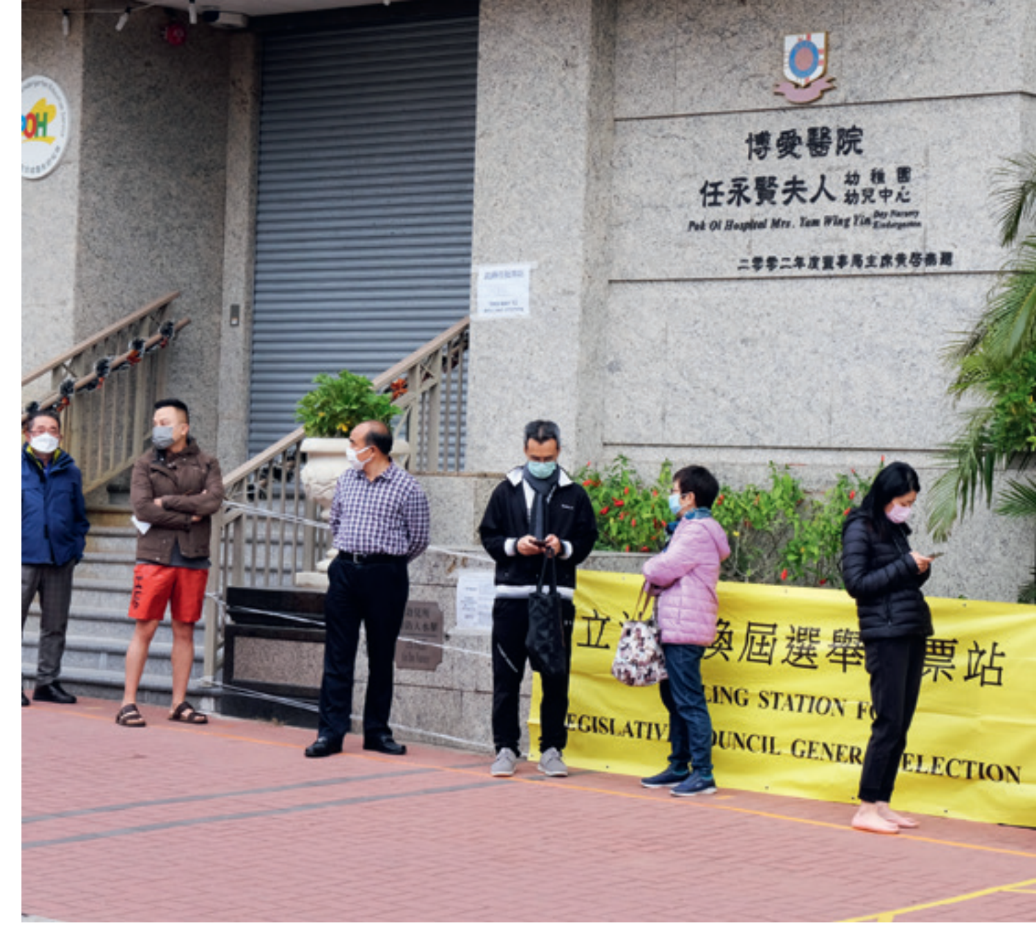
Voters line up outside a polling station in the Hong Kong Special Administrative Region (SAR) to cast their votes for the Legislative Council (LegCo) on December 19