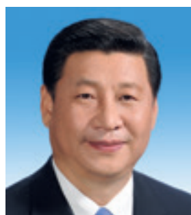
Xi Jinping Chairman