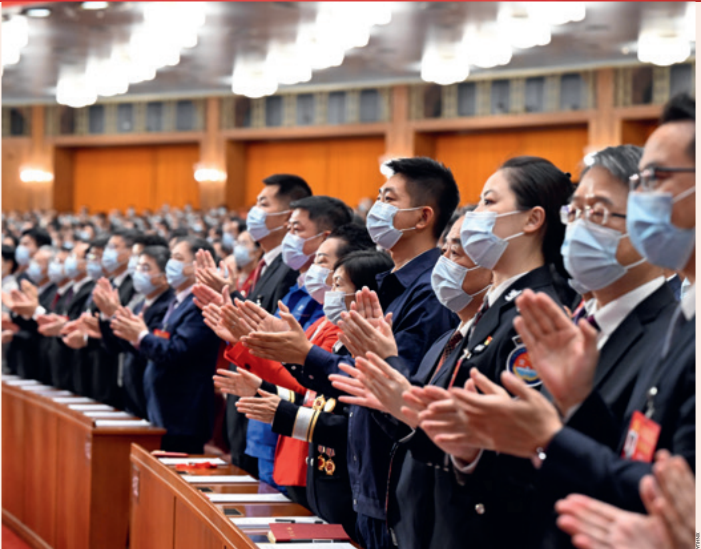
The 20th CPC National Congress concludes in Beijing on October 22

National Congress elected the 133 members of the Central Commission for Discipline Inspection (CCDI), who then elected their own Standing Committee, secretary and deputy secretaries, who were then approved by the October 23 plenum.