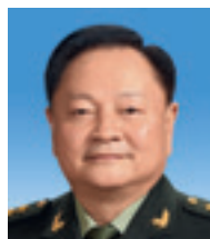
Zhang Youxia Vice Chairman