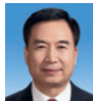
Li Xi Secretary