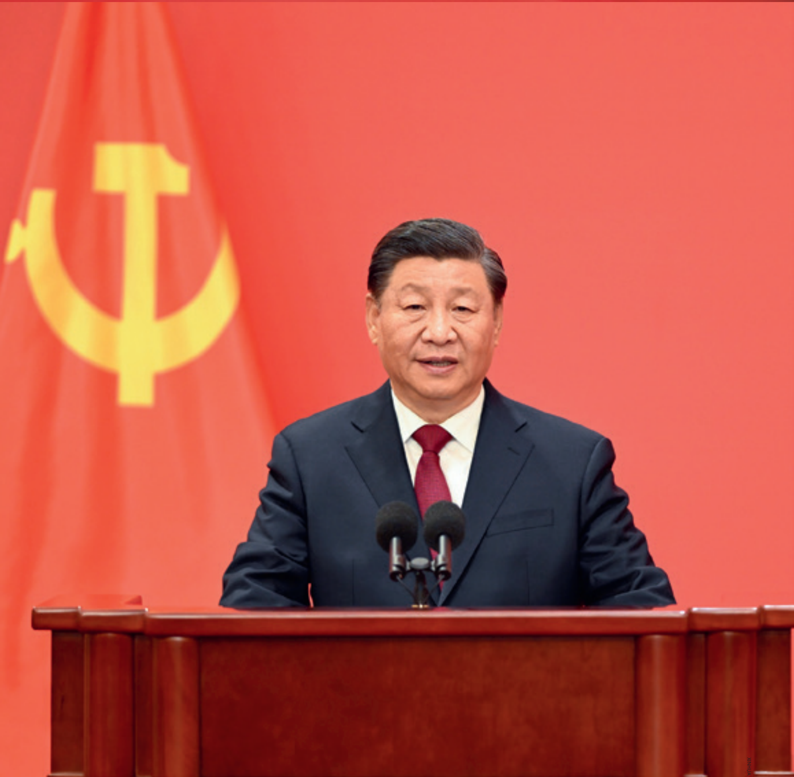
Xi Jinping, General Secretary of the Communist Party of China Central Committee, addresses the press at the Great Hall of the People in Beijing on October 23