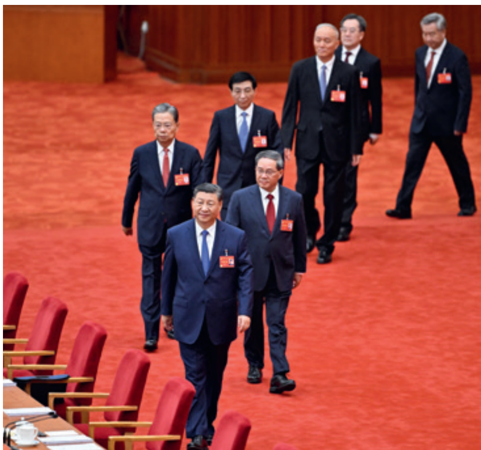
Party leaders Xi Jinping, Li Qiang, Zhao Leji, Wang Huning, Cai Qi, Ding Xuexiang and Li Xi arrive to attend the Third Plenary Session of the 20th Communist Party of China Central Committee, held in Beijing from July 15 to 18

CPC Central Committee adopts landmark resolution at its third plenary session