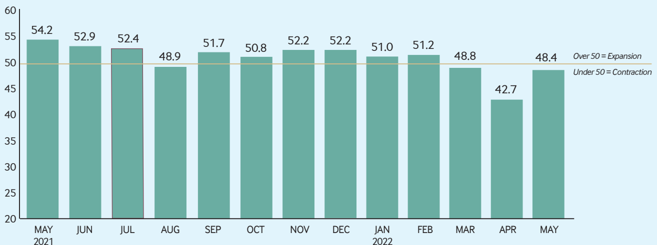
China's Comprehensive Purchasing Managers' Index (PMI)